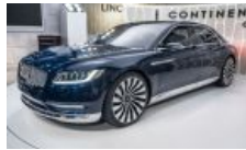
North American International Auto Show Photos