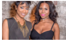
DRIVEN event photos