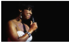
In Memoriam: Celebrities We Lost In 2016