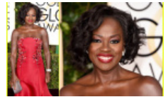
The Best Golden Globe red carpet looks of all time

Home » Community » Jazz piano master Kenny Barron arrives at MSU for week long residency