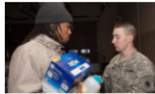
Flint water crisis in photos