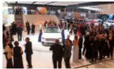
Inside the NAIAS Charity preview